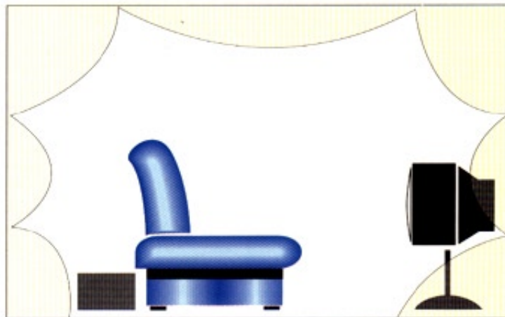
A listening room is an acoustic chamber that can be stimulated into resonance by the subwoofer.

One of the most enlightening experiences found in exploring the behavior of subwoofers in rooms is witnessing the effects of standing waves, otherwise known as a room resonance or mode. We have been studying about modes from the outside. Next, we dive into the interior of the standing wave. The first problem we will have is setting up a method to generate standing waves. Probably it is easiest to simply leave a security deposit with your favorite